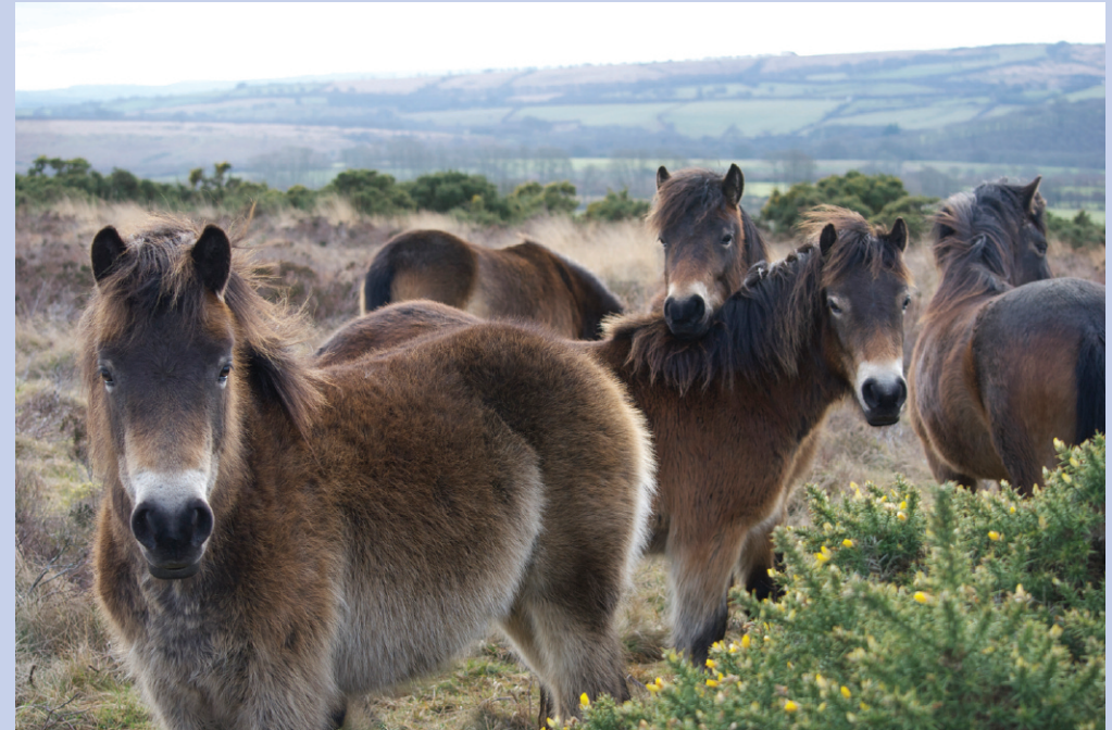
Top right: Some of the herd on Winsford Hill